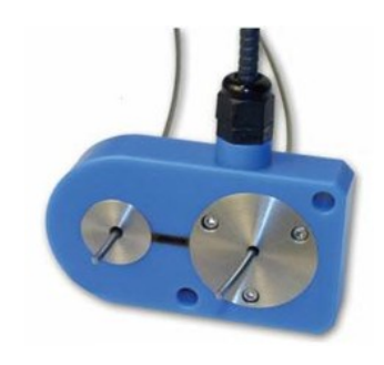
Figure 1 - Eddy Current Probe with Reference and Test Weld Wire

Equipment: InSite CT, Custom Eddy Current Probe